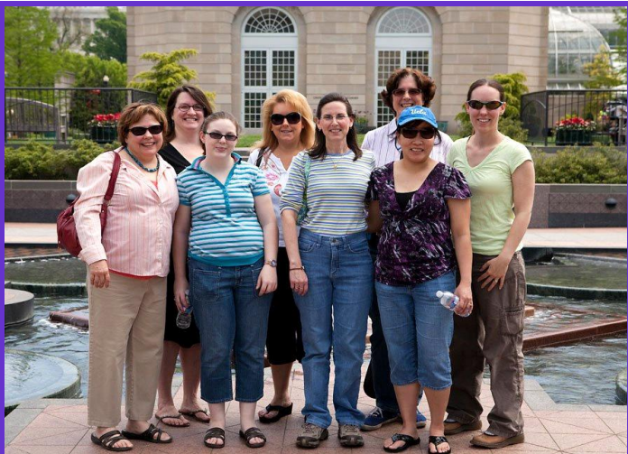
Women from Fellowship enjoyed a day in DC at the U.S. Botanic Garden in April. The next function for the group is a Mother's Day Breakfast, 9 AM, May 12, at the church. All women and daughters are invited.