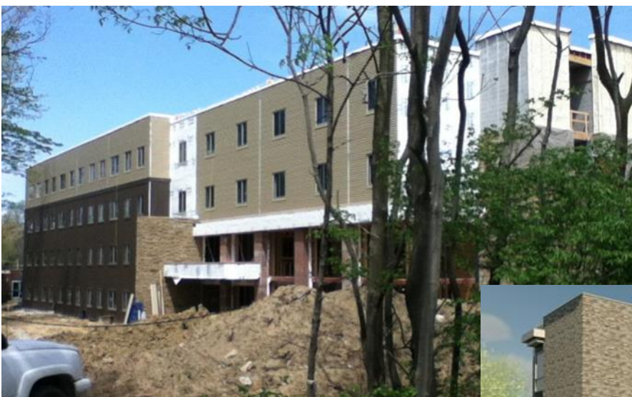
Recent Construction Photo

Not that long ago, it seemed like it would take a miracle for the Salt & Light Christian Fellowship to raise the necessary funds to break ground on their vision for an internationally-focused living and learning community on the campus of Purdue University. Now, Crosswalk Commons is becoming a reality thanks to the Lord's overwhelming provisions. Praise the Lord! He provided the miracle!